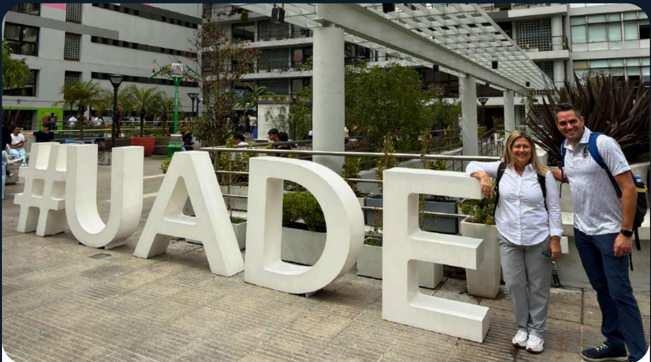
Ohio University (United States)