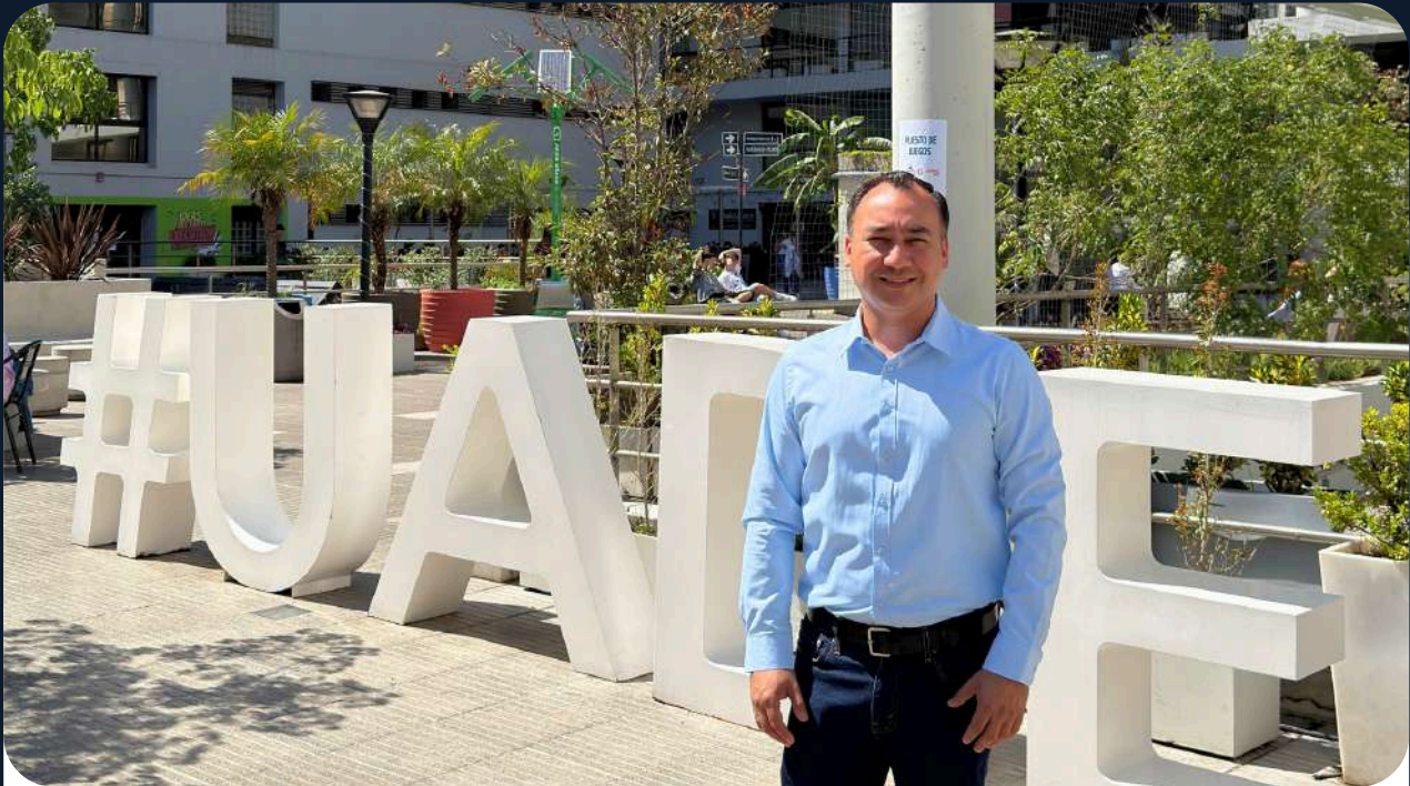
Universidad Tecnológica Privada de Santa Cruz (Bolivia)