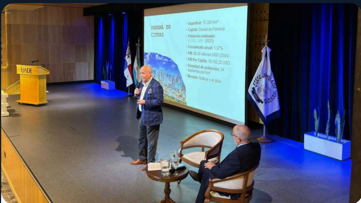
Visit of the Ambassador of Panama