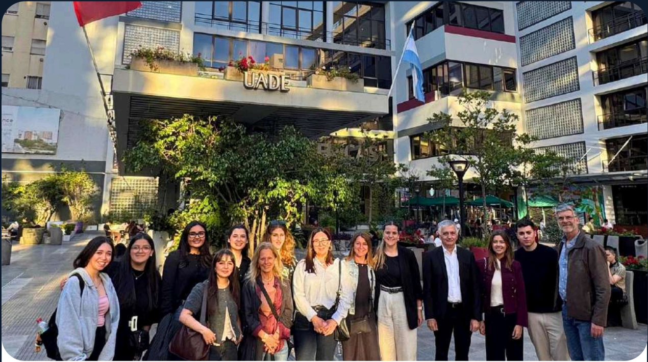
Universidad del Desarrollo (Chile)