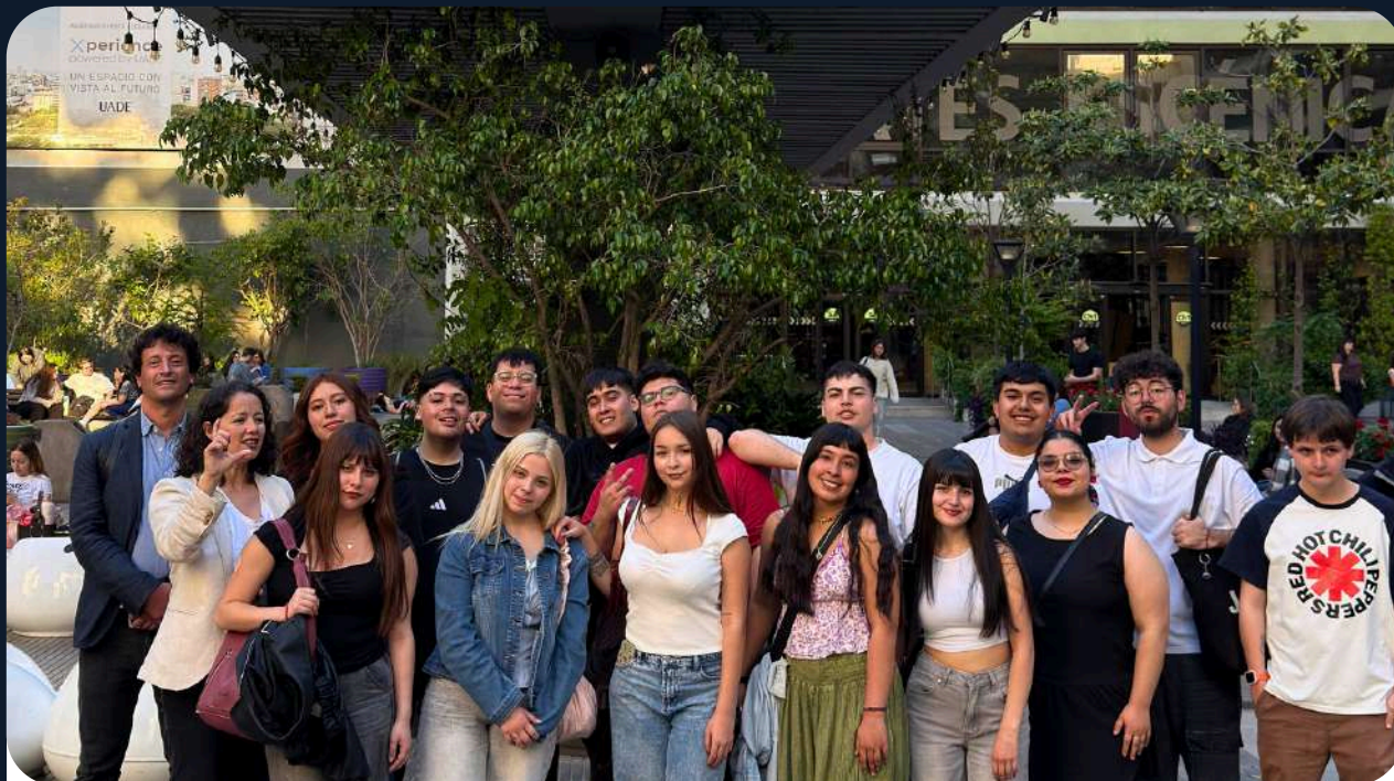
Universidad Andres Bello (Chile)