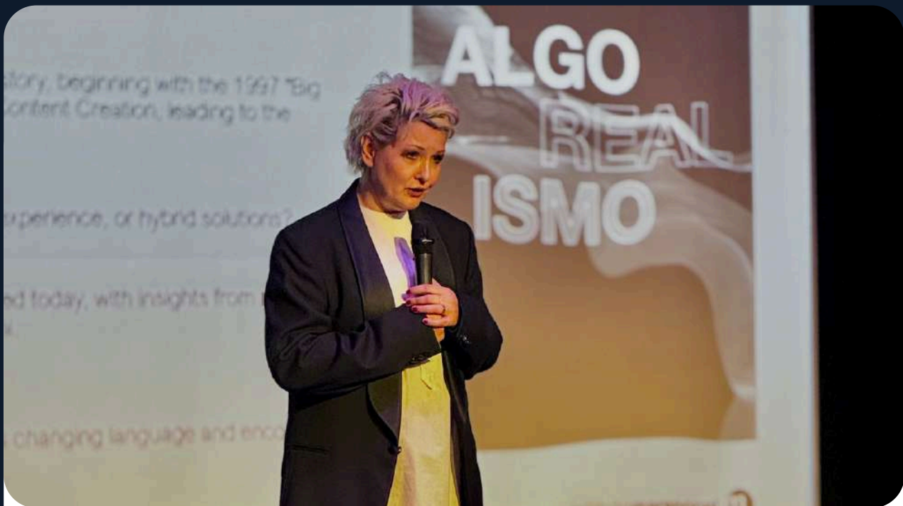
Instituto Marangoni (Italy)