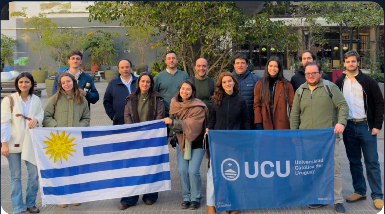
Universidad Católica de Uruguay (Uruguay)