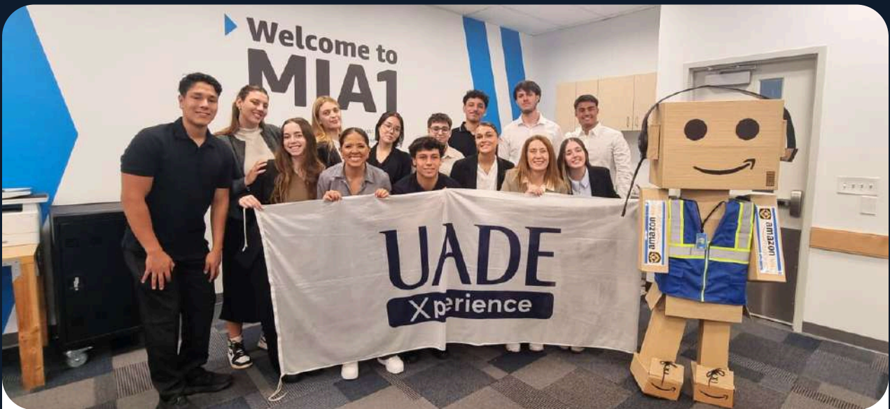
United States | Miami - FACE/FADI/FACO

In 2025, this initiative is renewed with an updated travel program, allowing students to learn by doing in key cities around the world.