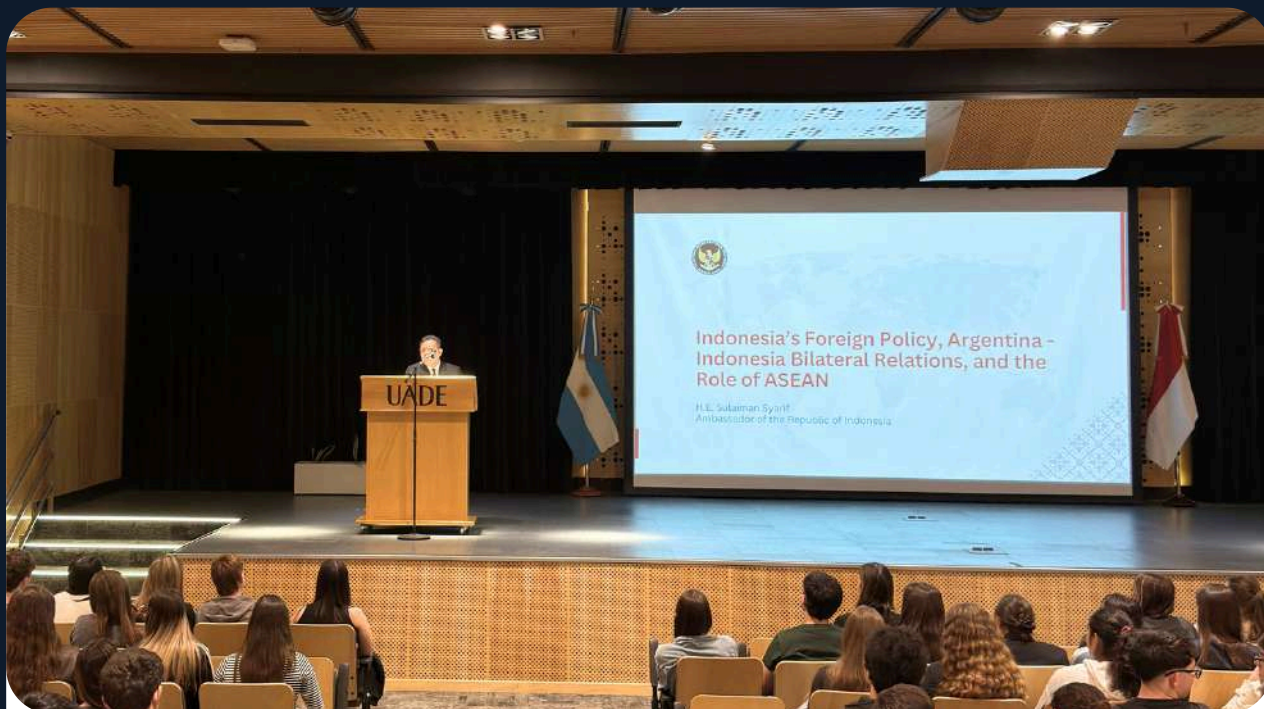
Visit of the Indonesian Ambassador