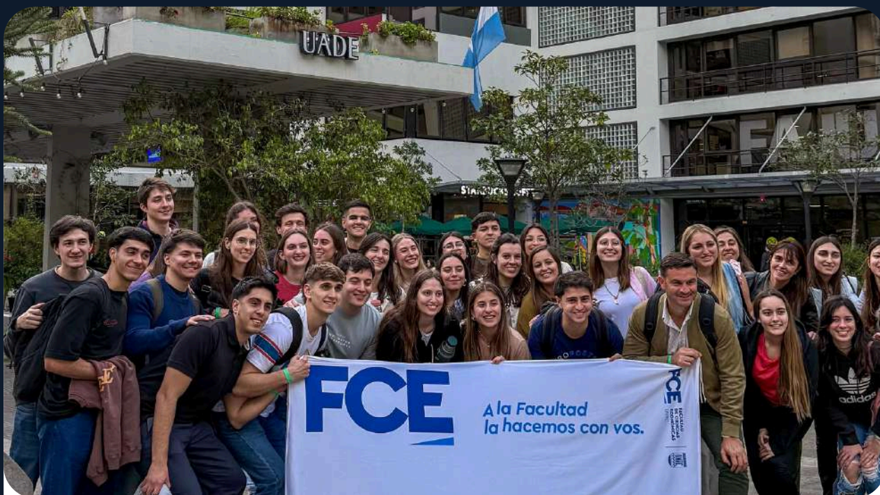
Universidad Nacional de Río Cuarto