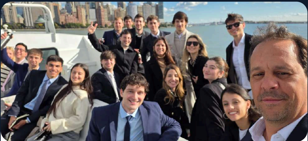
United States | New York - FACE