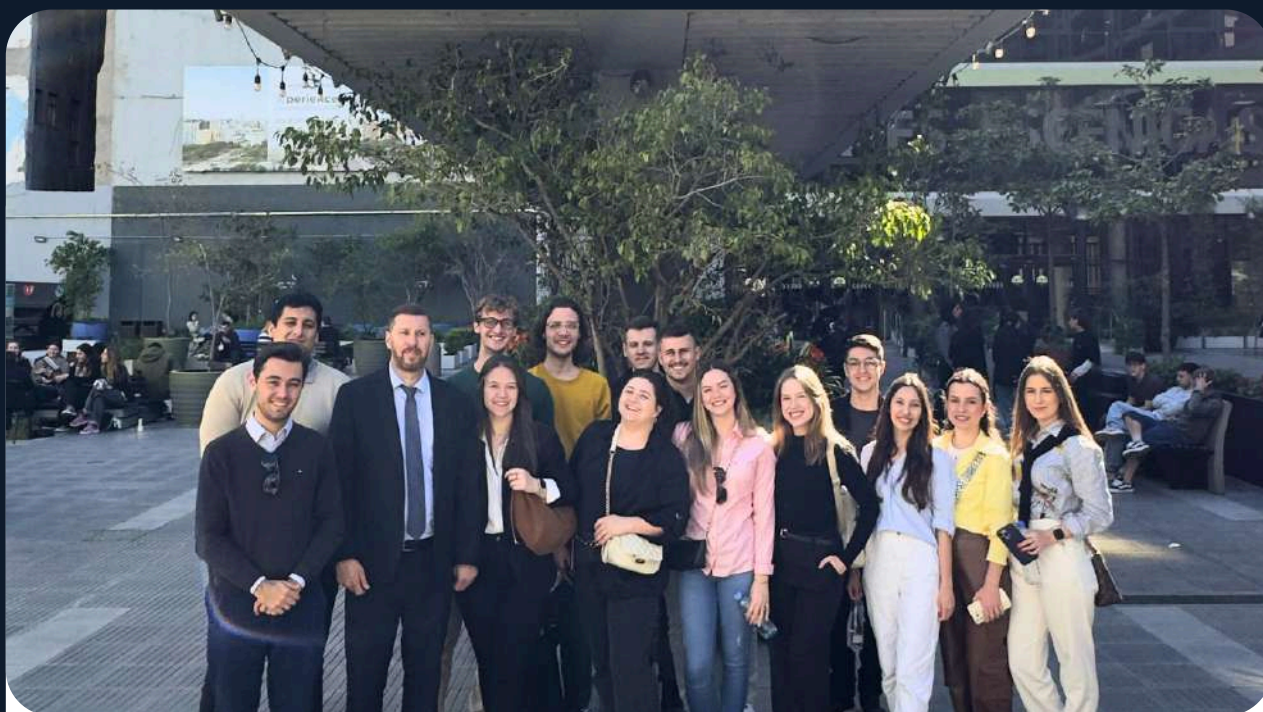
Univali - Universidade do Vale do Itajaí (Brazil)